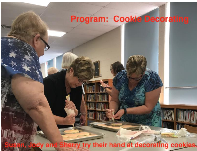
Program: Cookie Decorating