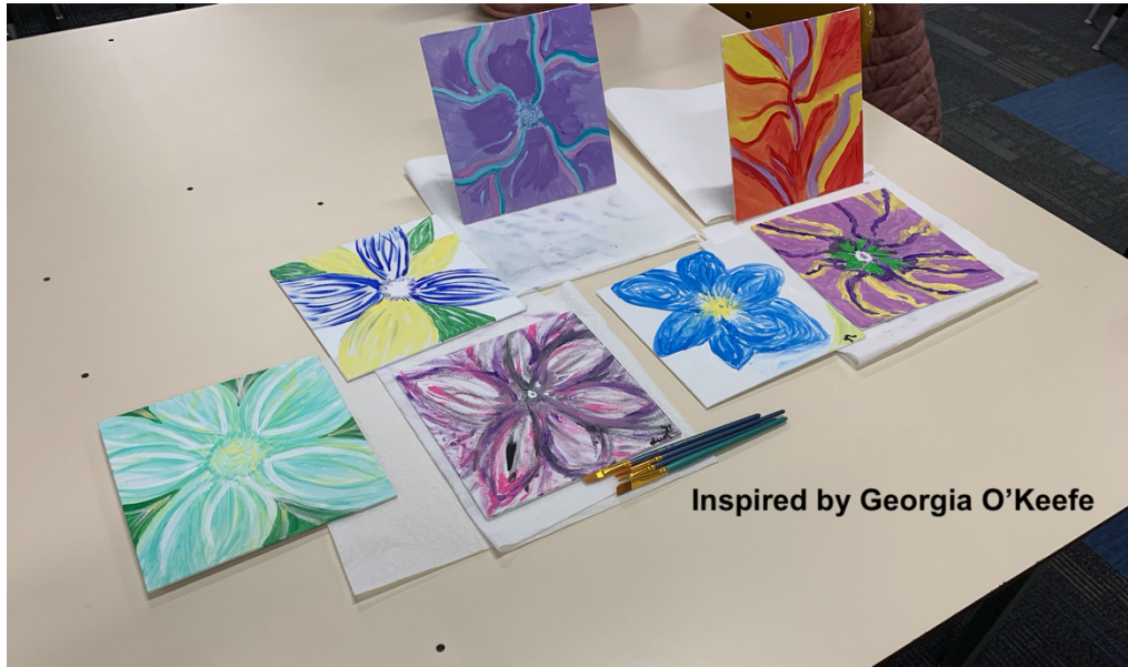
Inspired by Georgia O'Keefe