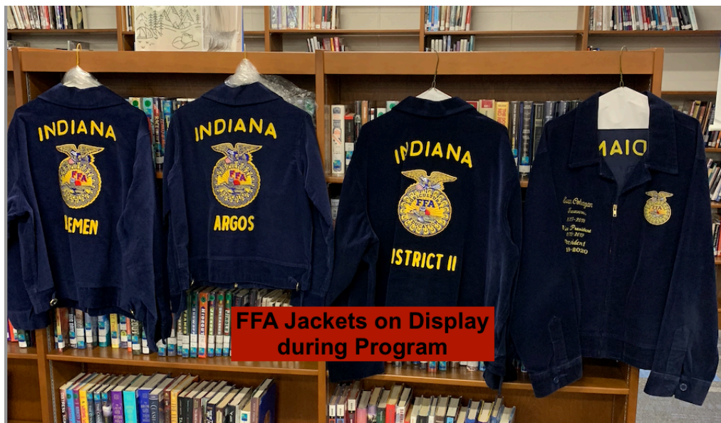
FFA Jackets on Display during Program